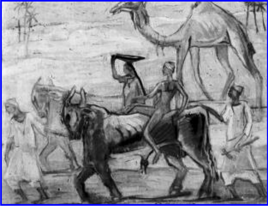
Figure 1 Raghib 'Ayad, Village Scene , oil on canvas, 1930.